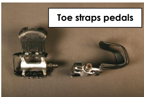
Toe straps pedals